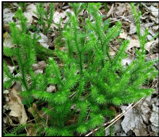
Figure 1. Lycopodium Clavatum Plant.