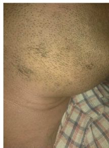
Figure 5. 8-9 Filiform warts on region of Whisker on right side of face (Closer view).