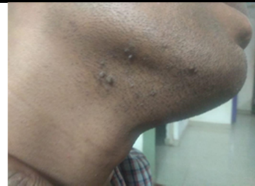
Figure 6. 8-9 Filiform warts on region of Whisker on right side of face (Lateral View).