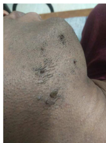
Figure 7. 6-7 warts with increase in size of wart on region of whisker on right side of face (Lateral View).