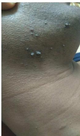
Figure 2. 12-13 filiform wart on region of whisker on right side of face (Lateral View).

On examination, there were multiple long narrow frond-like projections on the beard area extended from skin with typical digitate appearance which is the characteristic feature of filiform warts (Figures 2 & 3). He was otherwise healthy and there was no history related to immunodeficiency in the past [6].