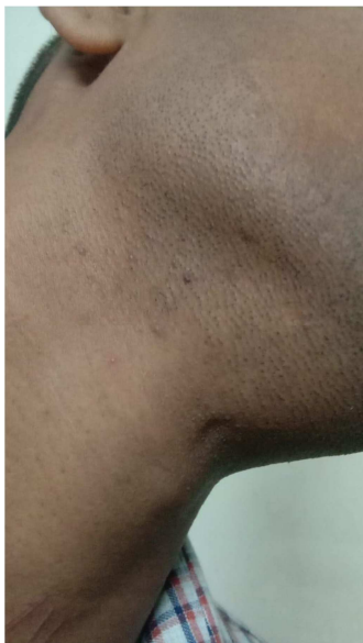
Figure 9. 1-2 wart seen on region of whisker on right side of face (lateral view).