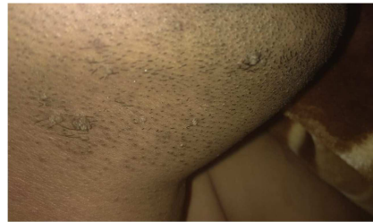
Figure 3. 12-13 filiform wart (Digitations are seen clearly) on right whisker region of face (Closer View).