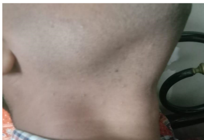
Figure 10. Clean shaved face with no new wart (Lateral view).